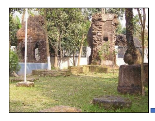
Birth Place of Begum Rokeya